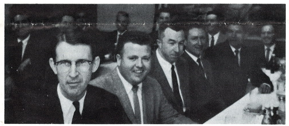
Corpus Christi — San Antonio and Houston Spokesman Clubs in Joint Meeting.